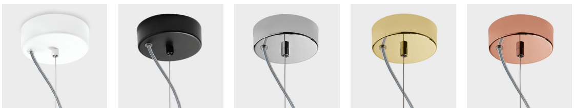
Ceiling rose detail